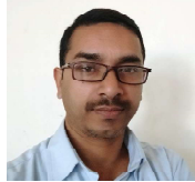
By: M.R. Lahu